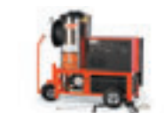
HOT-WATER PRESSURE WASHERS

NOTE: We are constantly improving and updating our products. Consequently, pictures, features and specifications in this brochure may differ slightly from current models. Flow rates and pressure ratings may vary due to variances allowed by manufacturers of our machine components. We attempt to keep our machine performance within ±5% of listed specifications.