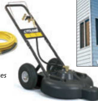
Rotary surface cleaner attaches to your pressure washer; reduces overspray and zebra striping

Telescoping wands extend to 24' to reach high places without scaffolding