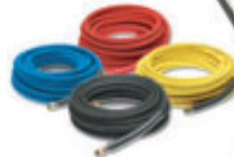
High-pressure hoses from 30 to 150-ft. lengths