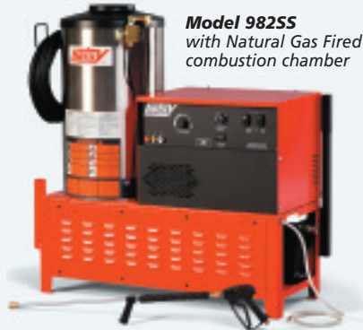
Model 9825S with Natural Gas Fired combustion chamber

Upright, oil fired burner delivers high efficiency and maintains constant temperature using diesel fuel, kerosene or home-heating oil